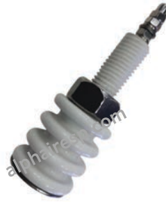
Feed-thru Insulator High purity \text{Ai2O3} Insulator