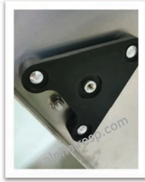
Triple Insulator on Collector