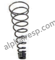
Ionizer Springs: Stainless Steel 304