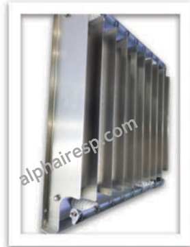
Ionizer Side View