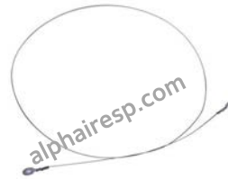
Ionizer Wires: 99.95% high purity tungsten